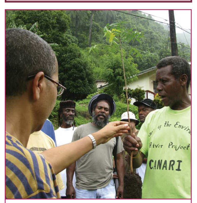
Partners of the Environment, in Saint Vincent, is a community organisation that is hoping for continuing support from its mentor as the group builds its capacity to operate sustainably.