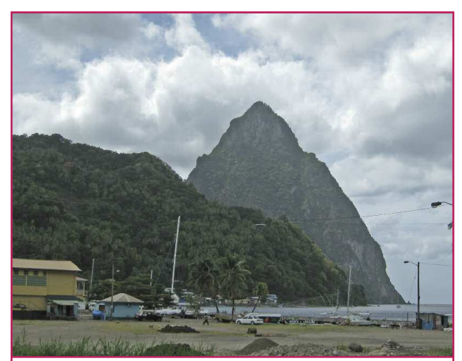
The breakdown of the institutional arrangement for communitybased management of Gros Piton tours has enabled a private entrepreneur to take over and reduced the community's involvement in decision-making and benefit-sharing.

For the purposes of this brief, a financially sustainable CBO is considered to be one that sustains itself through a diversified fundraising strategy (i.e. not over-dependent on a single source but that may include grant funding), which