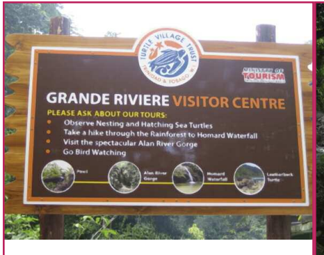
Turtle Village Trust partners with local communities in Grande Riviere and other "turtle villages" in N.E. Trinidad and S.W. Tobago.