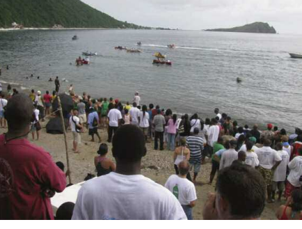
Stakeholders celebrate at a community day in the Soufriere Scotts Head Marine Reserve in Dominica, managed by a multistakeholder committee involving government, private sector, and community groups.

giving CBOs 'risk capital' in the form of small grants (US$1500-4000) to pursue small scale projects or capacity building activities, with either informal or formal mentoring. As illustrated by the example in Box 7, the results have outstripped those achieved from much larger investments and have created relationships that are contributing significantly to long-term sustainability.