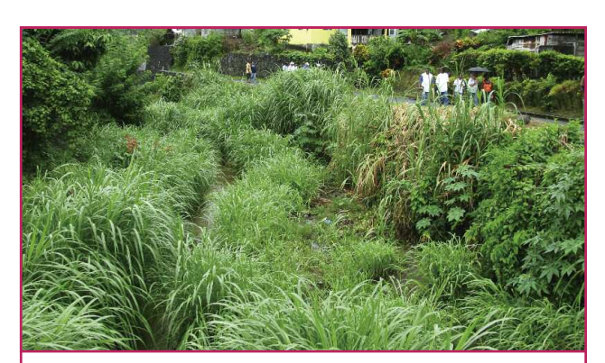
Partners of the Environment, in Chateaubelair Saint Vincent, did a project to clean up a river which was completely choked with elephant grass.

Newly-established CBOs find themselves in a difficult situation, similar to that faced by school or university graduates looking for employment – they don't have the track record to attract funding but without funding, they cannot establish a track record. CANARI has found that small grants, combined with mentoring, can be a winning combination. Both independently, and in collaboration with the International Institute for Environment and Development (IIED), CANARI has experimented with