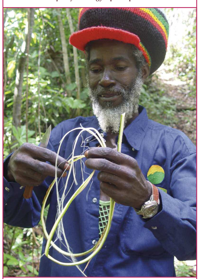
Resource users in rural communities have skills and knowledge that they can contribute to building sustainable livelihoods.