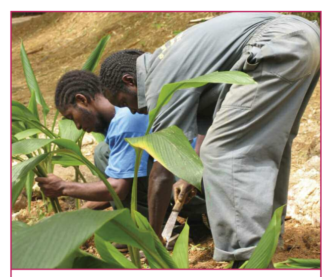
Members of the Fondes Amandes Community Reforestation Project planting in the Fondes Amandes watershed in north Trinidad.

Community participation in natural resource management cannot be effective without an enabling policy environment, not just in areas with obvious linkages such as land use planning, land tenure, agriculture, forestry and fisheries but also in terms of those relating to finance and economic development, social development, community development, civil society capacity building, and heritage