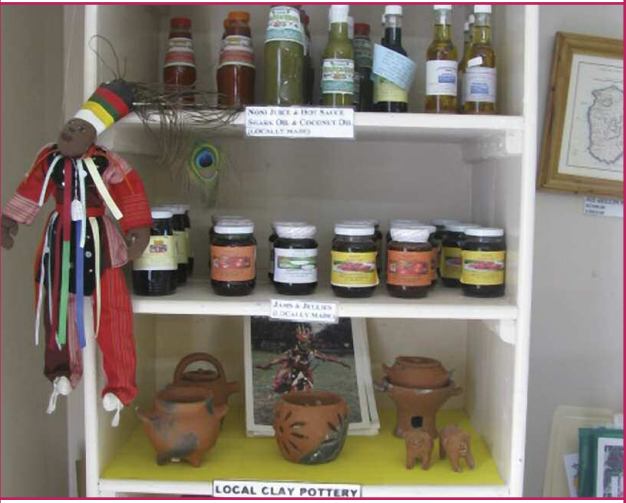
Nevis Historical & Conservation Society's diversified funding strategy includes selling locally made items.

covers its operational costs, including continuous capacity building, as well as any project or programme activity. Of course, there are many other aspects of sustainability, some of which are addressed below.