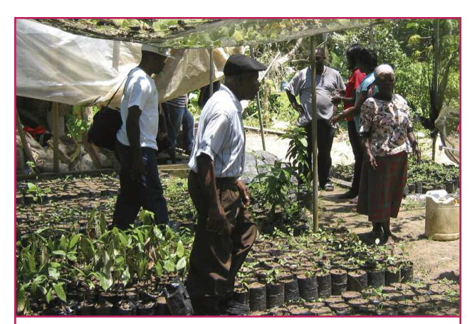
The Pencar Local Forest Management Committee in Jamaica maintains a nursery to provide the Forestry Department with seedlings for reforestation.