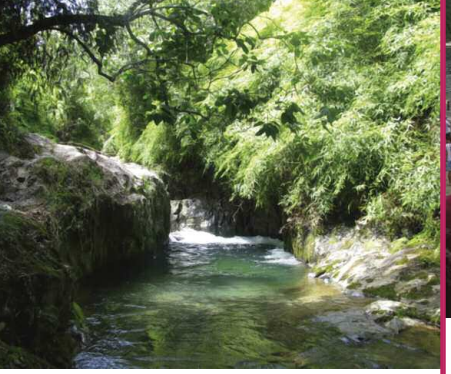
The Ebano Verde protected area in the Dominican Republic managed by the CBO, Progressio.