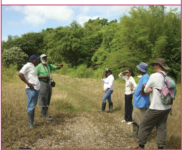
Stakeholders worked together in the field to plan how to manage the Aripo Savannas.