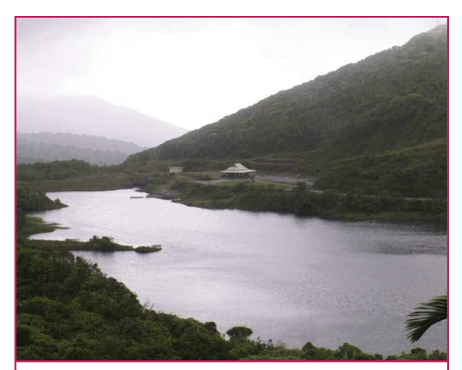
The community-based Calder's Dining and Aquatic Sports is conducting tours and managing the Visitor Centre in the famous Morne Trois Pitons World Heritage Site in Dominica.