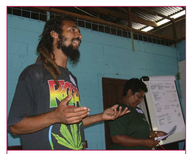
People in communities surrounding the Aripo Savannas were given the opportunity to express their ideas and needs as part of the management planning.

This presents a number of challenges even in a context such as the development of the Jamaica LFMCs where broad community engagement has been enshrined in the project design from the outset (see Box 5). These can be compounded by the fact that the support agencies may be sceptical of, or lack the requisite skills to conduct, such participatory processes. However, while effective community engagement of this kind will generally be a lengthy and iterative process, the livelihood and conservation benefits can be significant, including the fostering of relationships that improve the sustainability of the desired outcomes (see Box 6).